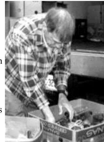
Volunteers help by sorting donations.